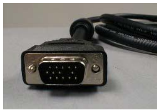
This is a standard VGA cable connector

In general, the order in which you do things with computers and projectors is very important: